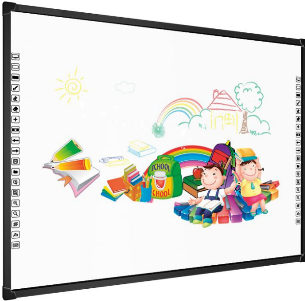
82" 96" 105" or other customized sizes are available.

EIBOARD interactive whiteboard is a large touchable display working with a projector and computer, any projected image in the whiteboard can be operated by pens or fingers directly. With CE , FCC , RoHs certificates.